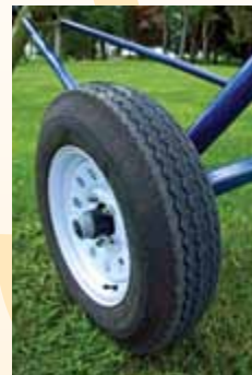
Deluxe rims with new 13" Highway rated tires