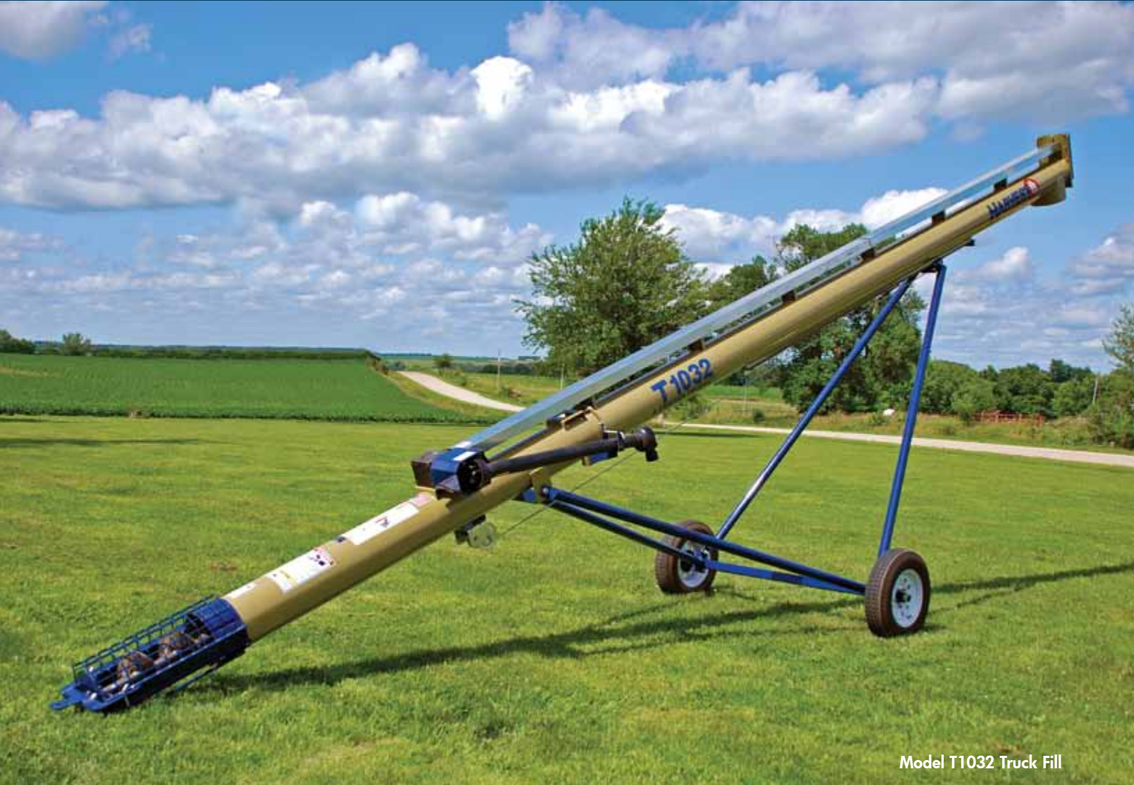
Model T1032 Truck Fill