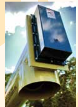
Top drive chain cover and lubrication housing features double-tapered bearings