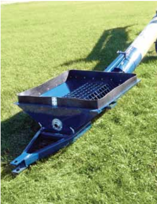
T10 Hopper features a removable hitch with sturdy transport latch and replaces the standard plastic hopper for a faster, easier loadout.