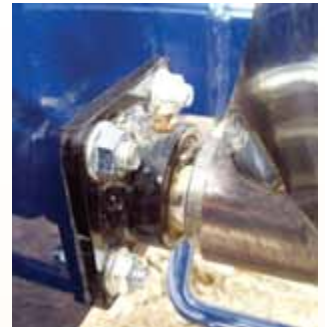
Long service life greasable, lower intake bushing assembly