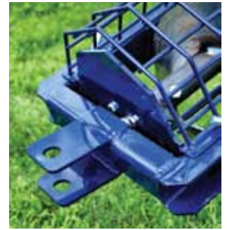
Heavy duty clevis hitch with easy 2-pin removal for hopper attachment