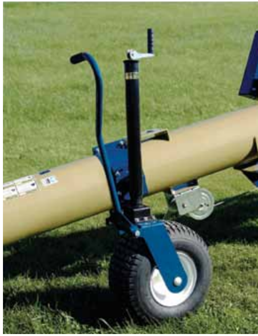
T10 Hopper wheel with guide handle for easy transport