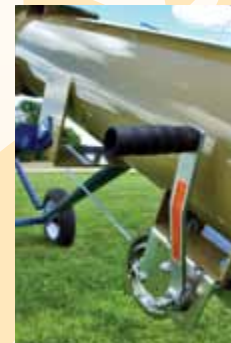
High-quality brake winch lowers and raises the auger