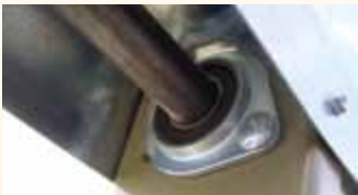
Sealed drive shaft bearings