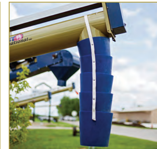
Flexible 3' discharge spout