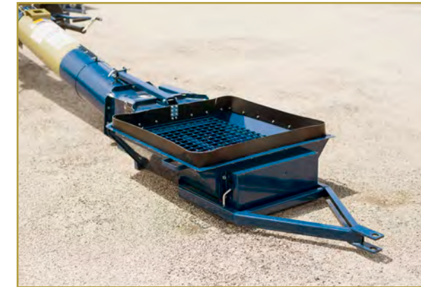
Flex hopper increases capacity up to 10% (T8 & 10 single flighting; T13 dual flighting)

Brand new tires & rims Highway rated w/ easy lube hubs