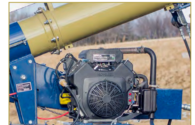
Gas drive option: available w/ 19HP Kohler EFI Engine (only on T832, T836, T1032, T1036 and T1036EXT models)