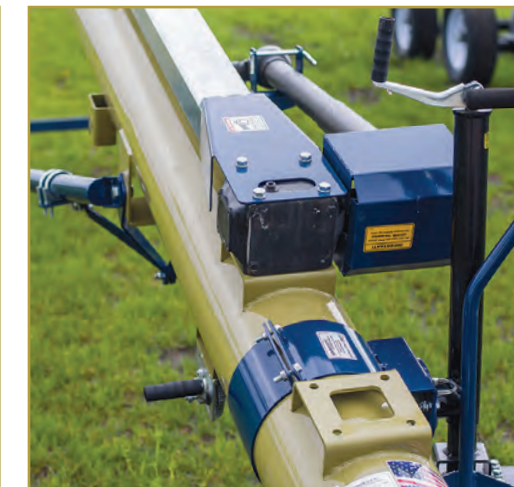
Extended lower gearbox mount