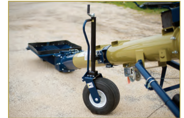
Wheel kit & jack w/ guide handle for easy yard maneuvering