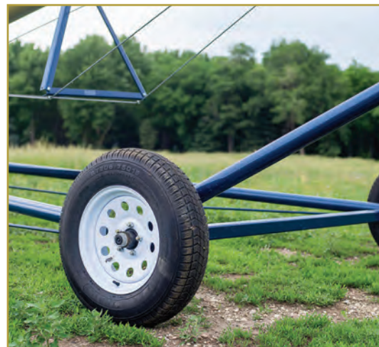
Brand new tires & rims