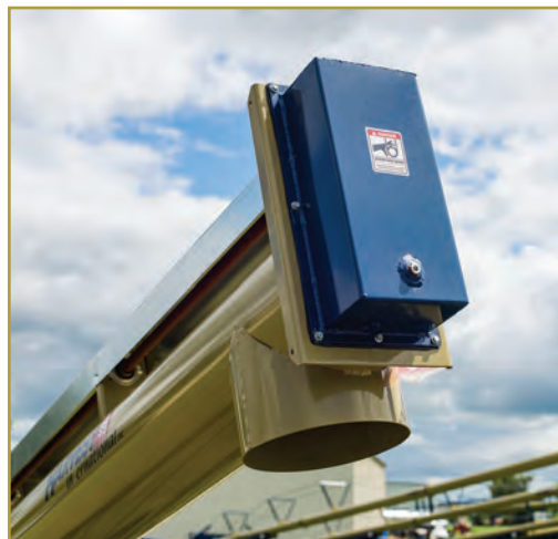
Weather sealed top drive cover