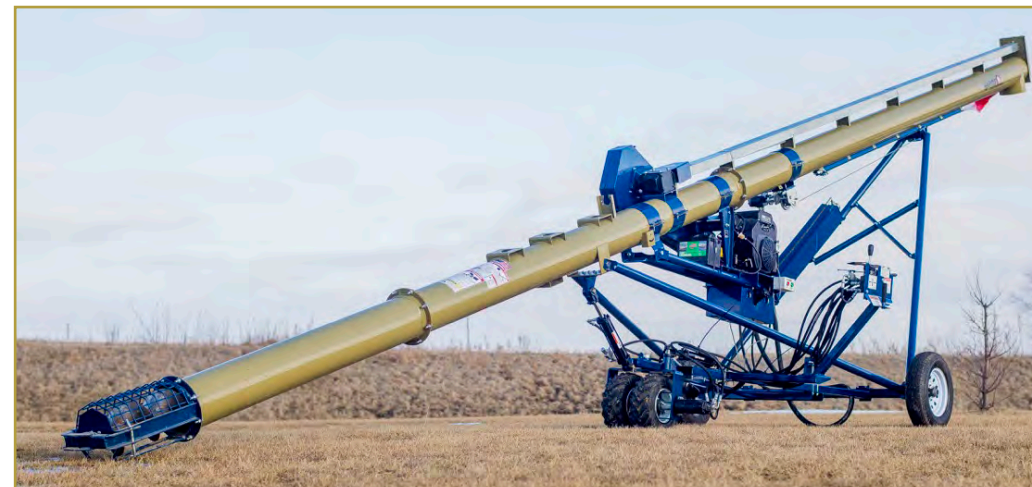
T1036EXT w/ HI PowerMove™ 6' intake extension, powered to drive under a bin.