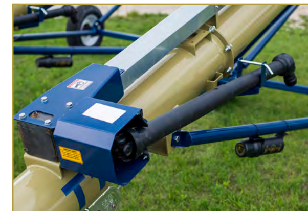
PTO Drive Option