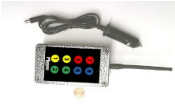
X8T-0002 HD Aluminum, Rechargeable Transmitter with Standard Overlay (optional)