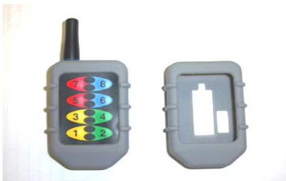
Left: X8T-0001 Transmitter with Optional Protective Boot